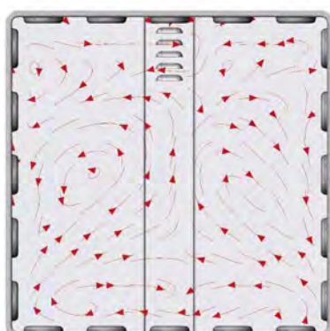
Air flow with natural convection

Due to the almost gas tight chamber, no outside air is exchanged. Therefore, the advantages of the uniform temperature distribution by the large surface all-round heating system applied in Memmert heating ovens come fully into play. Also without forced convection, the perfect interaction of the control system and heating unit ensures unparalleled temperature homogeneity and stability.